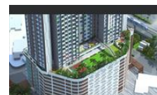
Podium Birds Eye