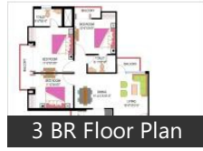
3 BR Floor Plan