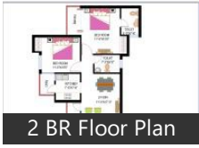
2 BR Floor Plan