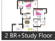
2 BR+Study Floor