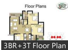
3BR+3T Floor Plan