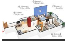
Floor Plan F