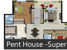
Pent House - Super