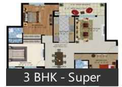
3 BHK - Super