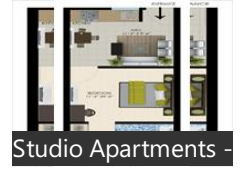
Studio Apartments -