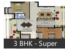
3 BHK - Super