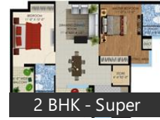
2 BHK - Super