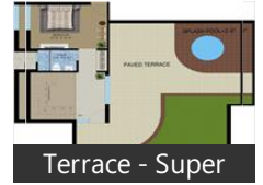
Terrace - Super

* These floor plans are of the project and might not represent the property