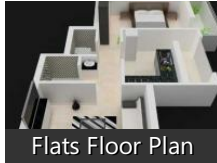
Flats Floor Plan