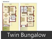
Twin Bungalow Floor Plan