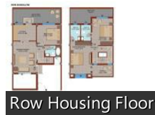
Row Housing Floor Plan