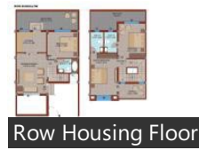
Row Housing Floor