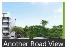
Another Road View