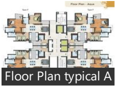
Floor Plan typical A