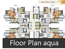
Floor Plan aqua