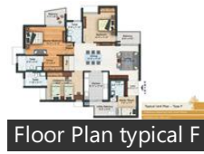
Floor Plan typical F