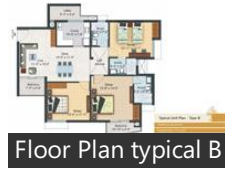
Floor Plan typical B