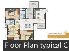
Floor Plan typical C