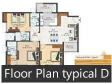
Floor Plan typical D