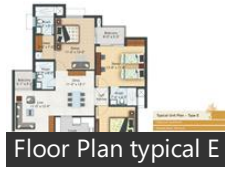
Floor Plan typical E