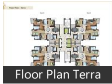
Floor Plan Terra