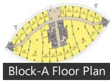
Block-A Floor Plan