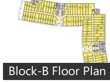
Block-B Floor Plan