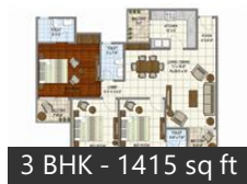
3 BHK - 1415 sq ft