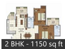
2 BHK - 1150 sq ft