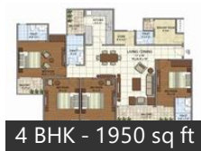
4 BHK - 1950 sq ft