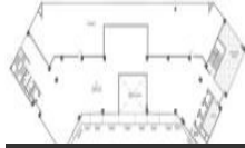
11th Floor Plan