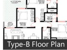
Type-B Floor Plan