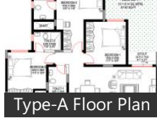
Type-A Floor Plan