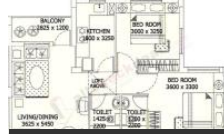
2BR Floor Plan