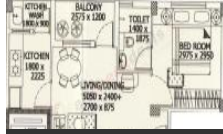
1 BR Floor Plan