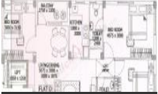
3BR Floor Plan