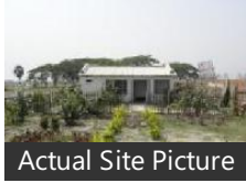
Actual Site Picture