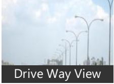
Drive Way View