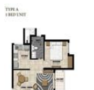
Floor Plan F