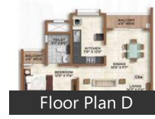
Floor Plan D