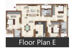
Floor Plan E

* These floor plans are of the project and might not represent the property