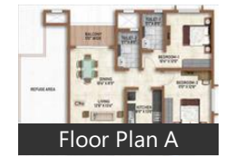
Floor Plan A