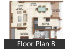
Floor Plan B