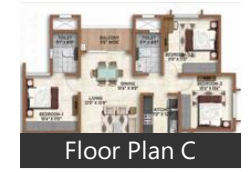
Floor Plan C