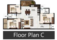
Floor Plan C