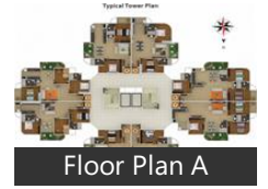
Floor Plan A