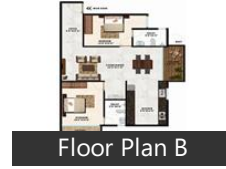
Floor Plan B