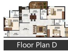
Floor Plan D