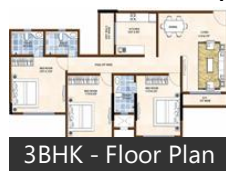
3BHK - Floor Plan