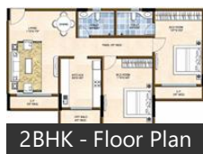
2BHK - Floor Plan