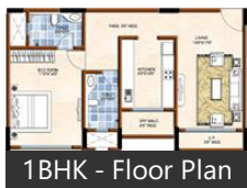
1BHK - Floor Plan