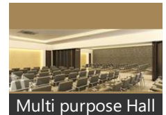
Multi purpose Hall