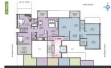
Stilt Floor Plan