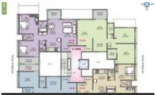
Even Floor Plans