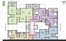
Odd Floor Plans