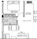
Floor Plan B