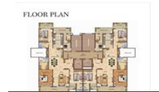
Floor Plan B