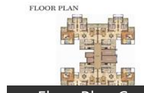
Floor Plan C