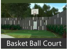
Basket Ball Court