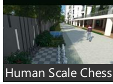
Human Scale Chess