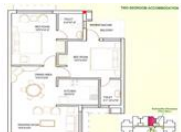
2BHK Floor Plan