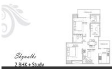
Floor Plan 2Bhk