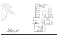
Floor Plan 3Bhk