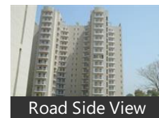
Road Side View

* These pictures are of the project and might not represent the property