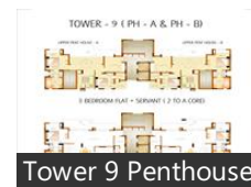
Tower 9 Penthouse