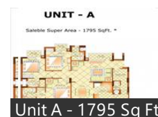
Unit A - 1795 Sq Ft

* These floor plans are of the project and might not