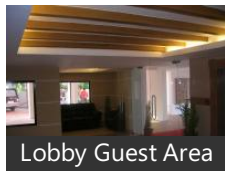
Lobby Guest Area