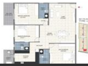
Floor Plan B