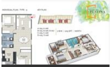
Floor Plan D