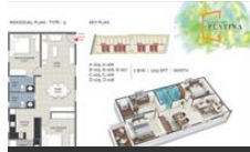
Floor Plan E