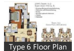
Type 6 Floor Plan

* These floor plans are of the project and might not represent the property