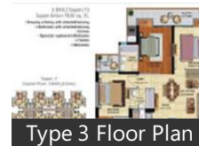
Type 3 Floor Plan