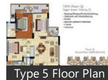
Type 5 Floor Plan