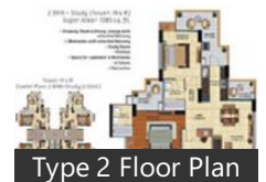
Type 2 Floor Plan