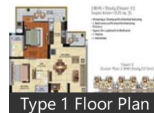
Type 1 Floor Plan