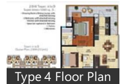
Type 4 Floor Plan