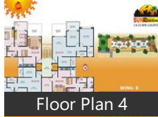
Floor Plan 4