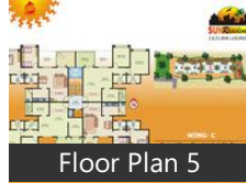
Floor Plan 5