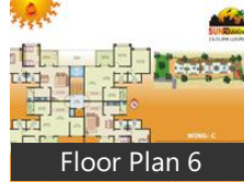
Floor Plan 6