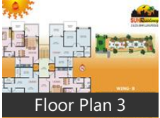
Floor Plan 3