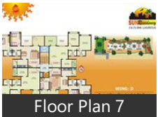
Floor Plan 7