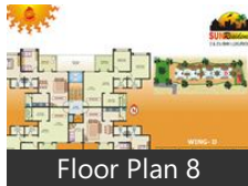
Floor Plan 8