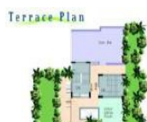
Terrace Floor Plan