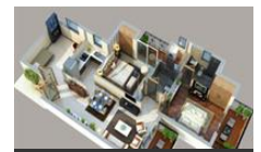
Type 2 Floor Plan