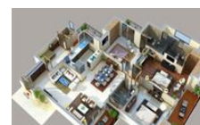
Type 5 Floor Plan