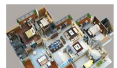
Type 6 Floor Plan

* These floor plans are of the project and might not represent the property