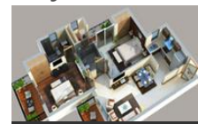
Type 1 Floor Plan