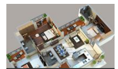
Type 4 Floor Plan