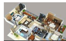
Type 3 Floor Plan