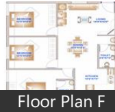
Floor Plan F