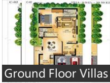
Ground Floor Villas