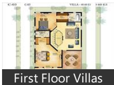
First Floor Villas