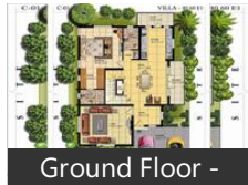
Ground Floor -