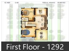
First Floor - 1292