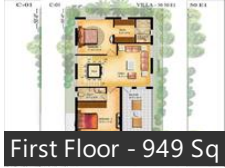
First Floor - 949 Sq