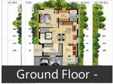
Ground Floor -