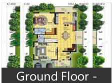
Ground Floor -