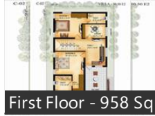
First Floor - 958 Sq