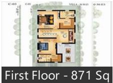
First Floor - 871 Sq