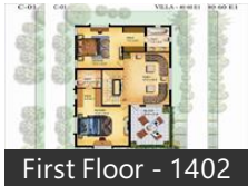
First Floor - 1402