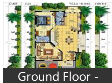
Ground Floor -