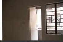
Inside View B