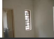
Inside View A