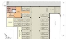
Basement 2 Floor