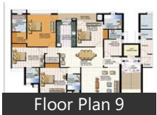
Floor Plan 9