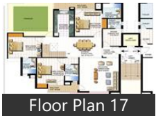
Floor Plan 17