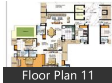
Floor Plan 11