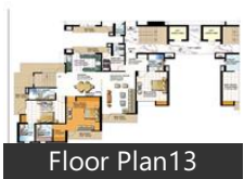
Floor Plan 13