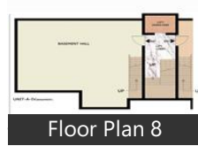
Floor Plan 8