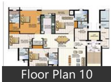
Floor Plan 10