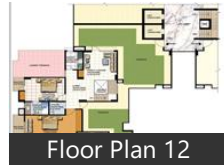
Floor Plan 12