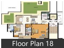
Floor Plan 18