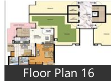
Floor Plan 16