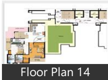
Floor Plan 14