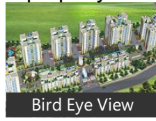
Bird Eye View