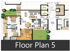
Floor Plan 5