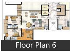
Floor Plan 6