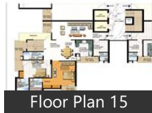
Floor Plan 15