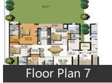
Floor Plan 7