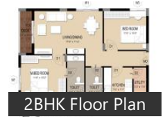
2BHK Floor Plan