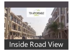
Inside Road View

* These pictures are of the project and might not represent the property