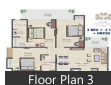
Floor Plan 3