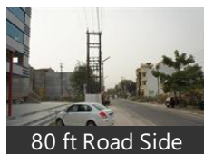
80 ft Road Side