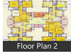
Floor Plan 2