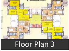
Floor Plan 3