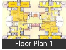
Floor Plan 1