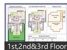
1st, 2nd & 3rd Floor