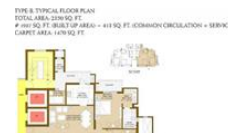
Floor Plan B