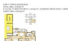
Floor Plan C