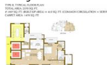
Floor Plan A