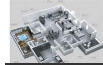
Floor Plan D