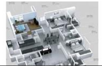
Floor Plan C