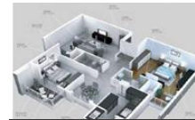
Floor Plan B