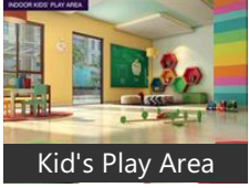
Kid's Play Area