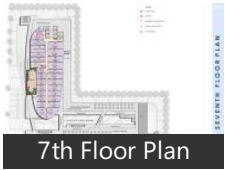
7th Floor Plan