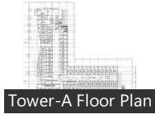
Tower-A Floor Plan