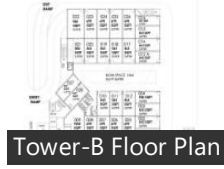
Tower-B Floor Plan