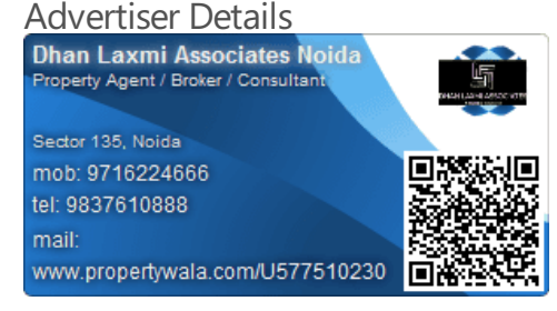
Scan QR code to get the contact info on your mobile