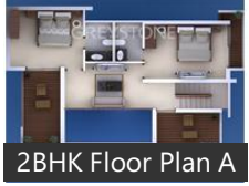
2BHK Floor Plan A