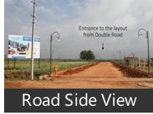
Road Side View