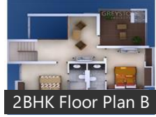
2BHK Floor Plan B