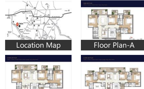
Floor Plan-B Plan-(